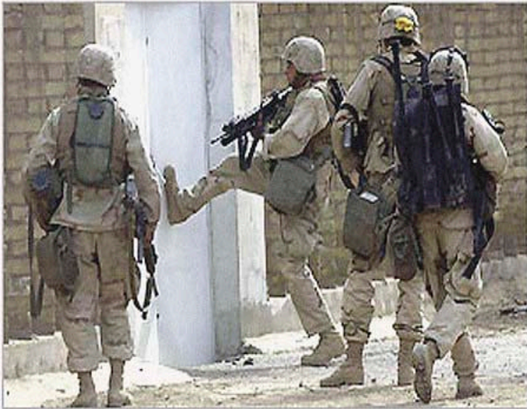
U.S. Marines try to kick open a door as troops search Baghdad to arrest looters and try to bring order to the city on Sunday April 13, 2003.